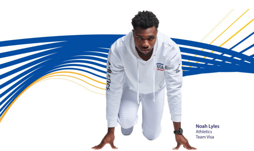
Noah Lyles Athletics Team Visa