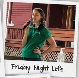
Friday Night Life