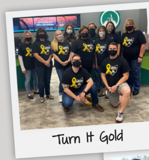
Turn It Gold