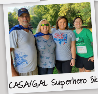
CASA/GAL Superhero 5k